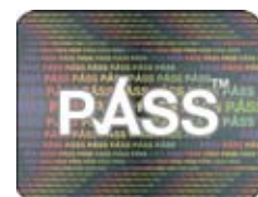
PASS Hologram Logo

In order to help, the Department of Health will be reminding people – particularly teenagers – via a communications campaign, of the need to carry proof of age from an accredited PASS scheme.