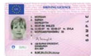
Photo Driving Licence